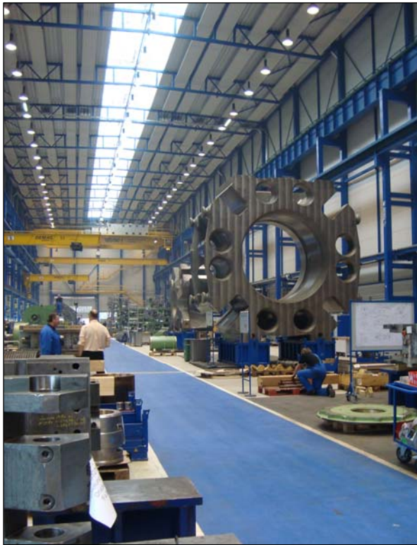
Picture 1 View into a production hall of SMS Meer in Mönchengladbach: Safety at work, but also comfort is very important - the employees wear safety shoes made by Baltes with the temperature regulating Outlast® lining.